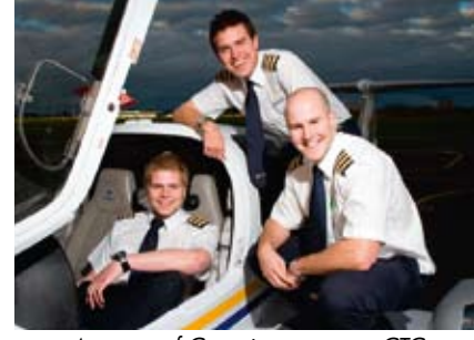
A group of C cat instructors at CTC

trainee airline pilot. While it might be thought that the focus of VI is on managing technological systems, this is in fact only one part of the equation. The key to VI, is ensuring that the trainee's technical and non technical skills are developed logically and