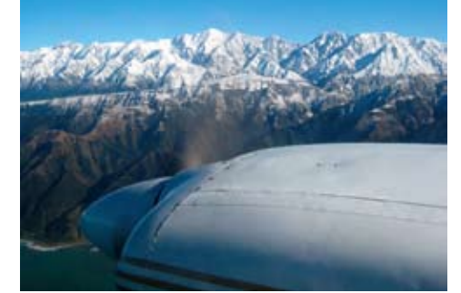
HELiPRO offer both helicopter and fixed wing training from several bases in the North and South Islands.

training from other HELiPRO satellite training bases at Taupo, Palmerston North and Nelson.