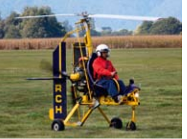
Dual training is conducted in the school's Eagle Gyros (left) with students continuing solo in their own aircraft.

Modern gyroplanes offer very safe, economical and versatile flying and now form the fastest growing sector of private aviation throughout the world. It is evident that training in New Zealand must expand to follow this trend and to this end Gyrate is currently increasing its own instructor base, expanding its ground school facilities