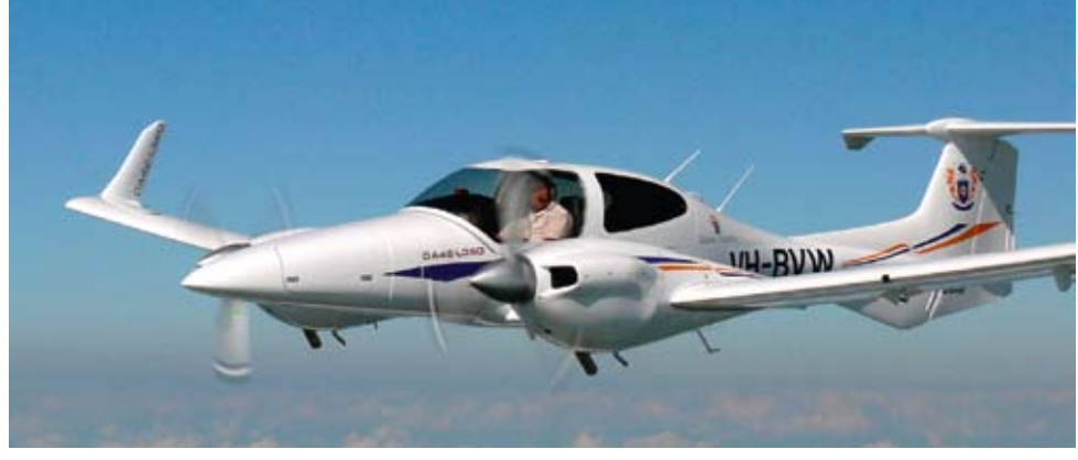
Massey University School of Aviation have just purchased two new Diamond DA42 (above) and twelve new Diamond DA40 aircraft. All are fitted with Garmin G1000 glass cockpits (below).

The Massey University Bachelor of Aviation - Air Transport Pilot degree is a fully integrated professional degree which focuses on training not just pilots, but quality aviators. The degree is structured to provide students with a comprehensive understanding of the aviation industry, and not merely the knowledge needed to obtain a professional pilot's licence. The philosophy of the School is to produce