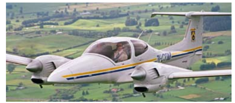
CTC's fleet of Diamond aircraft include DA20's and DA42's (above).

Alongside the technical and non technical skills and critically important to the ultimate success of the trainee is the insistence on cultivating the right training culture that values professionalism and installs discipline and compliance. Combating ill discipline early by identifying and promoting a culture of professionalism is essential to establishing positive behaviours and attitudes that will have the most influence in protecting the trainee from an accident.