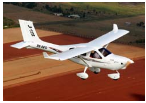
Train in a brand new Jabiru J230 with Euro Flight International at Tauranga Airport.

Euro Flight can also train you for microlight certificates, night and aerobatic ratings.